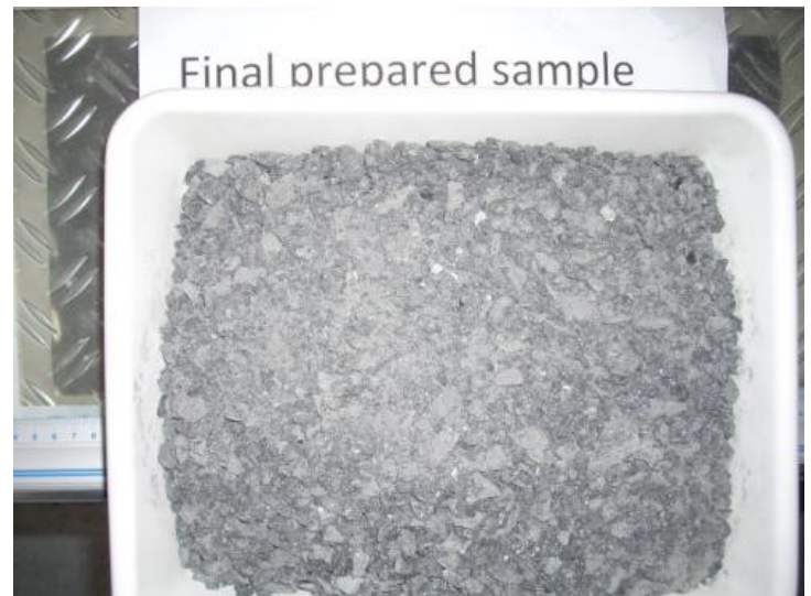
Final prepared sample