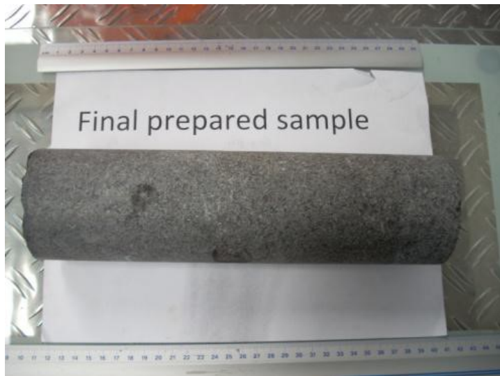
Original sample marble